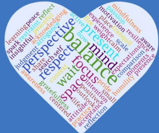
TEENS' ONE WORD TAKEAWAYS